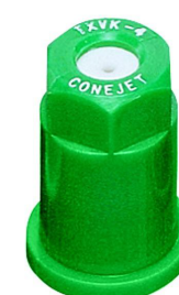
Part# 182937 0.058 GPM @ 30PSI 0.067 GPM @ 40PSI