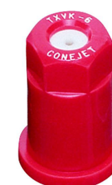
Part# 182938 0.088 GPM @ 30PSI 0.100 GPM @ 40PSI