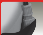
Protective Nozzle Storage