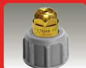
TX-8 Brass Conejet® Nozzle