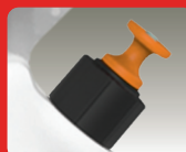
Pressure Release Valve