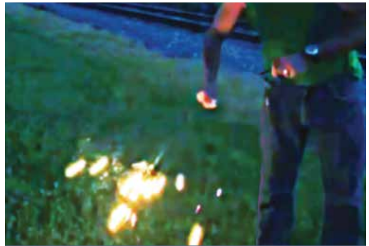
SINGLE STRIKE ACROSS THE ROD USING GUIDED STRIKING BLADE.

Compromising on innovation is not in our DNA. We believe in providing best-in-class survival gear for those who prepare for the worst while expecting the best. We take pride in providing American Made products for those who protect our country everyday.